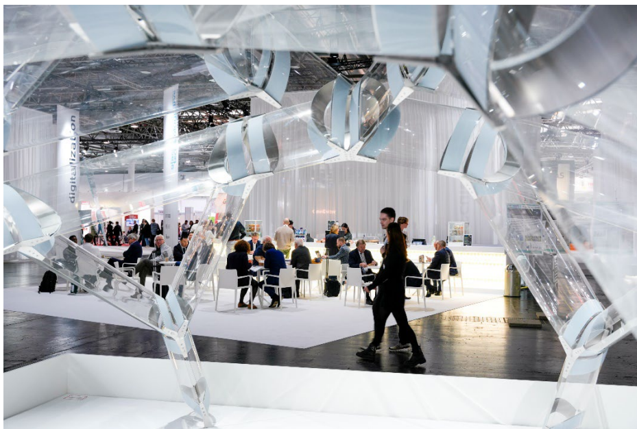
glass technology live (gtl)