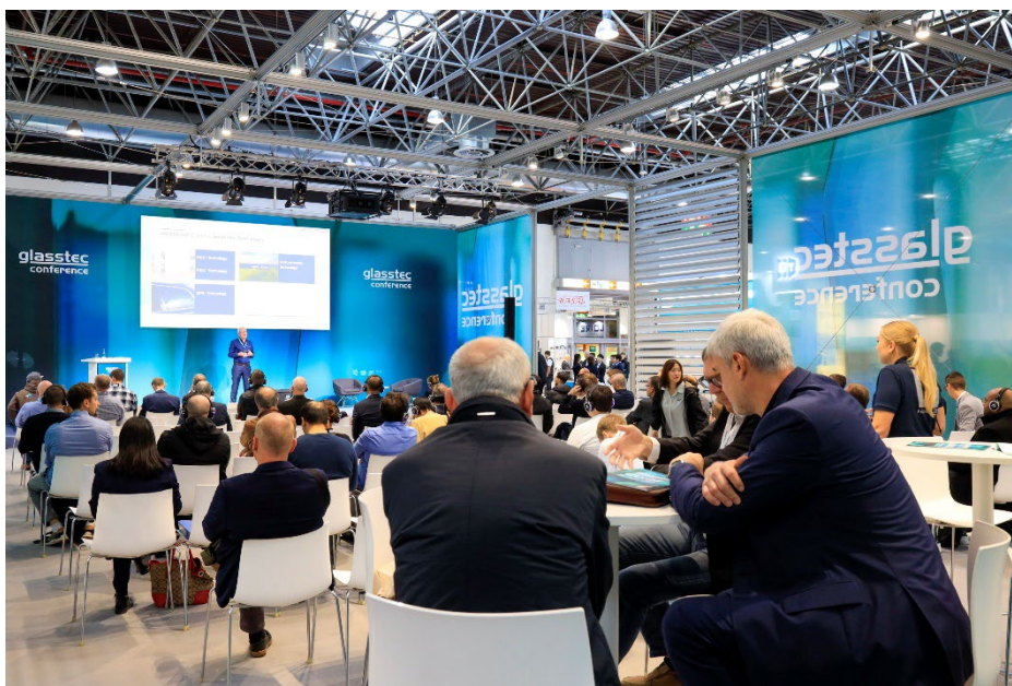
glasstec conference 2024