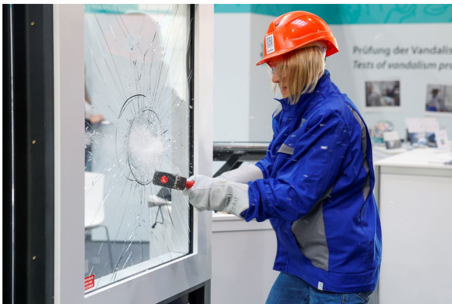
Handwerk LIVE, IFT Rosenheim, Vandalism Test